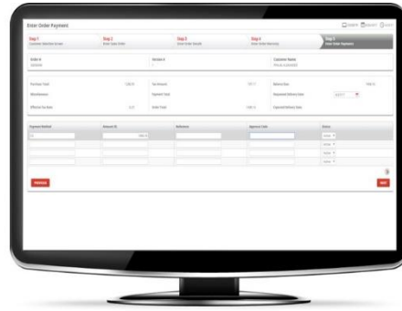
Payment selection and order completion

To know more about our IT services and solutions: