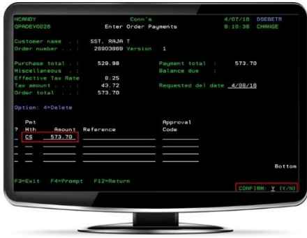
Payment selection and order completion